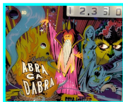
Abracadabra Gottlieb 12,360